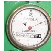
DIAL 3" HMA

Meter dials register water consumption similar to a vehicle's mileage odometer...read (left to right) & report ALL digits, including ALL ZEROS.