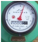
DIAL 1" HMA